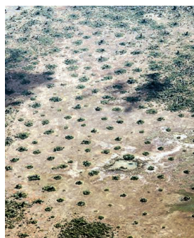
Plant-covered termite mounds dot Mozambique landscape.

Tarnita and Juan Bonachela, now at the University of Strathclyde in the United Kingdom, provided the model with different rainfall scenarios, and it predicted what would happen to the plants on and off the mounds over time. In dry conditions, the vegetation on the termite homes per-